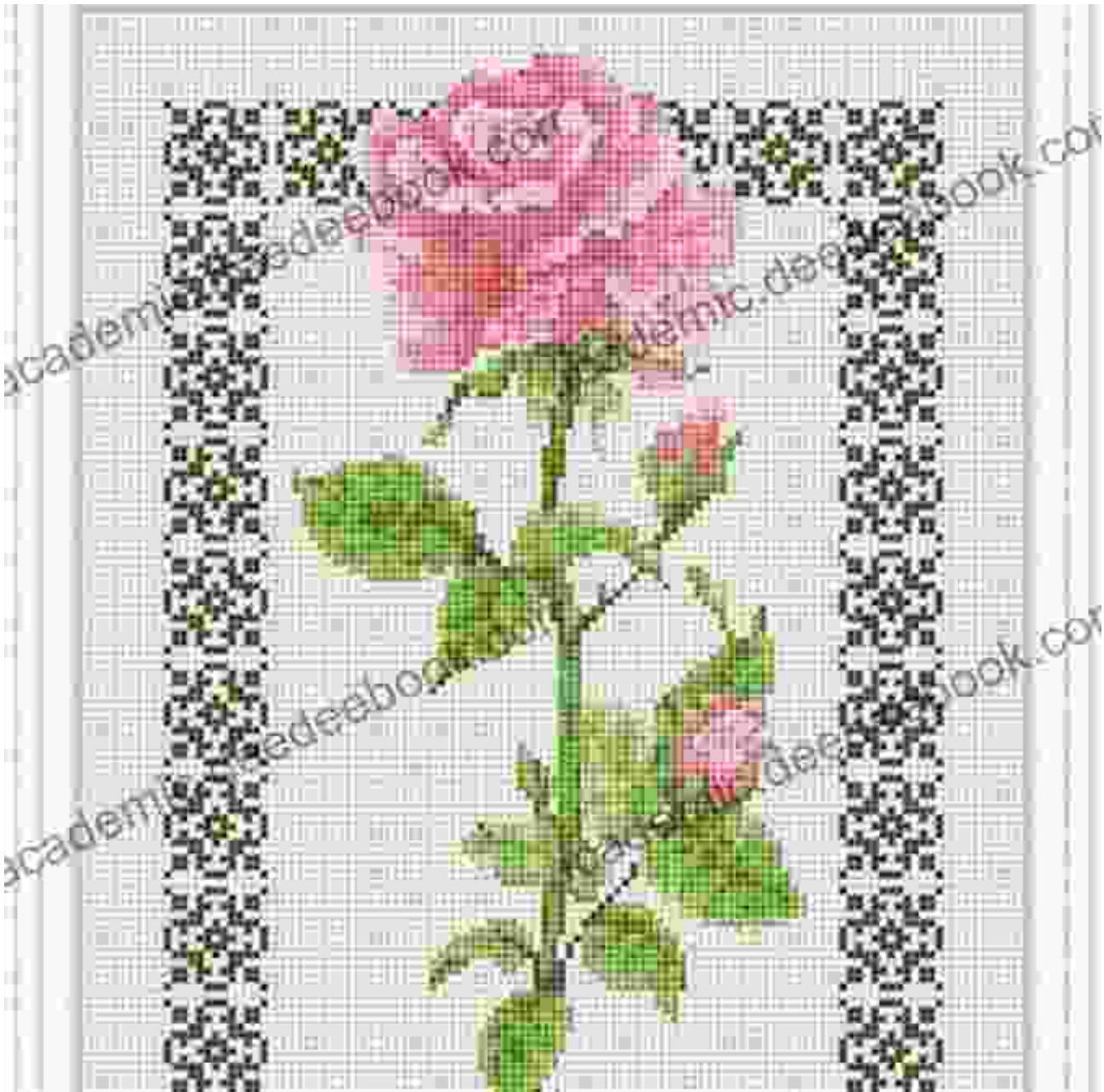
Traditional Cross Stitch Pattern