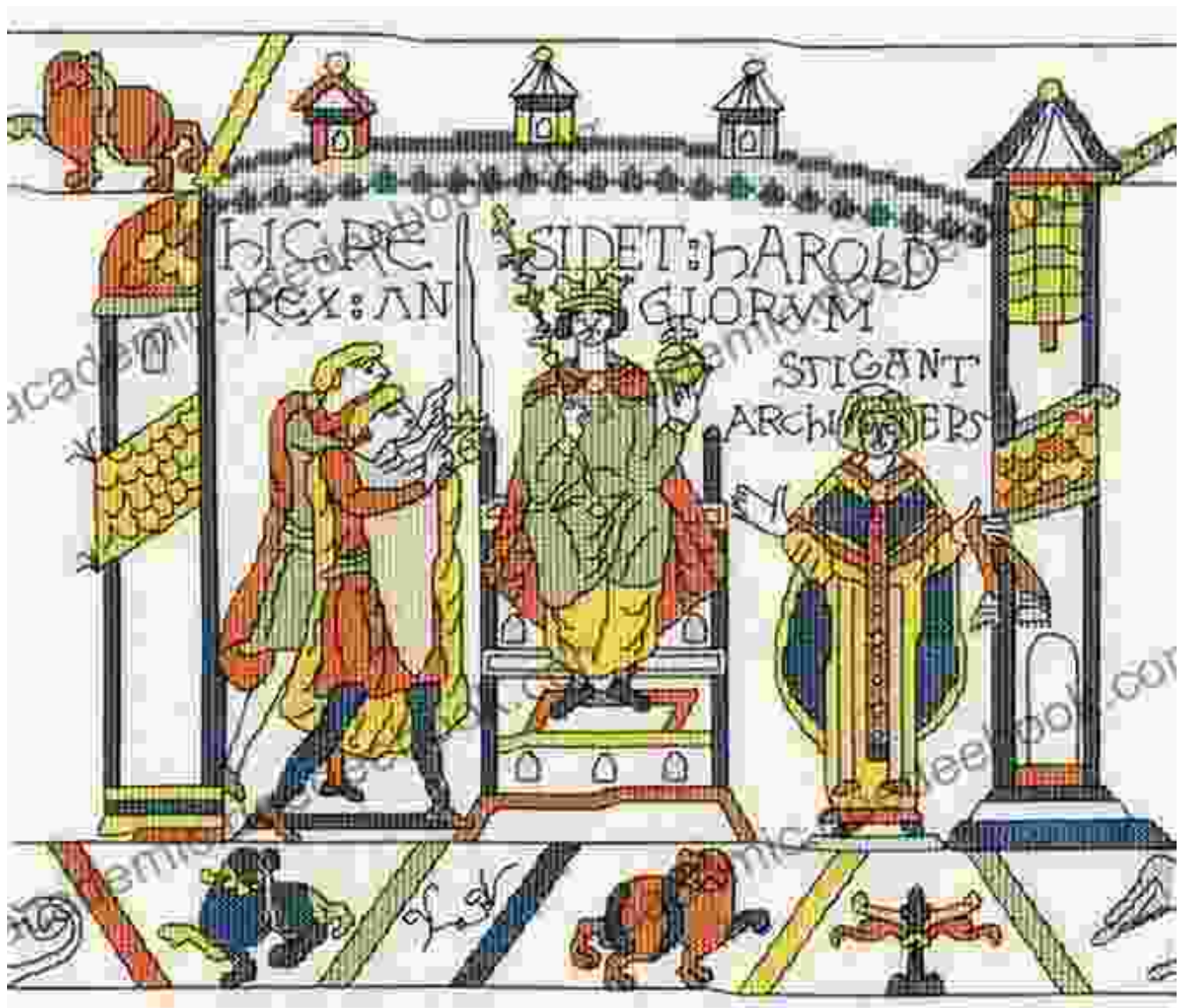
The Bayeux Tapestry

During the Middle Ages, counted cross stitch became increasingly popular in Europe, particularly in monasteries and convents. Skilled artisans used the technique to create elaborate tapestries, wall hangings, and other decorative items. The Bayeux Tapestry, a remarkable 11th-century embroidery depicting the Norman conquest of England, is one of the most famous examples of medieval cross stitch.