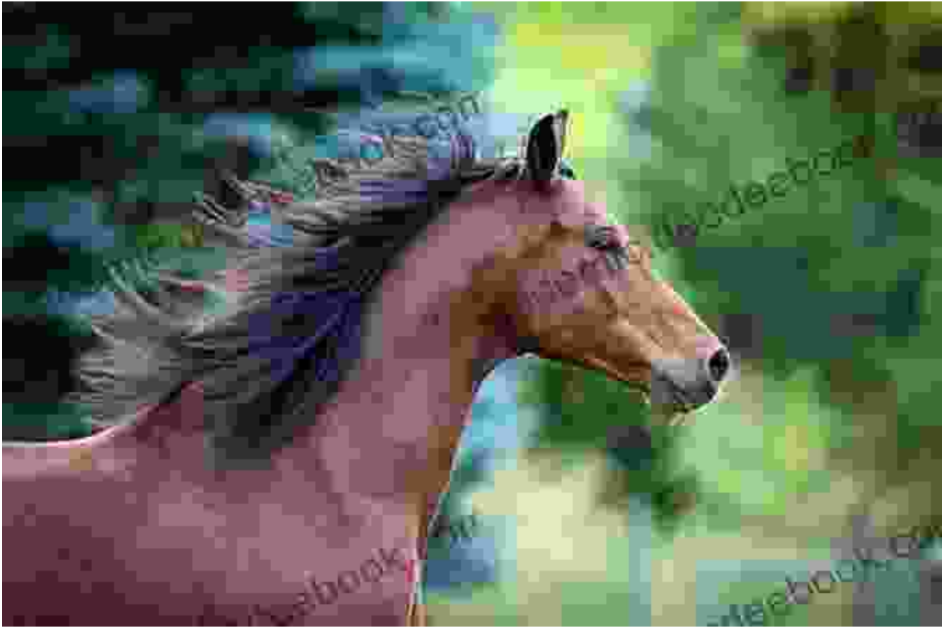
The beauty and grace of a legendary racing horse