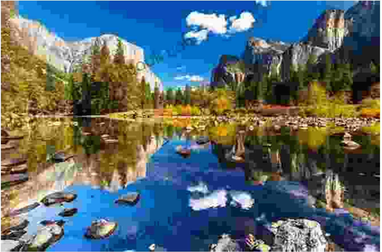
Yosemite National Park